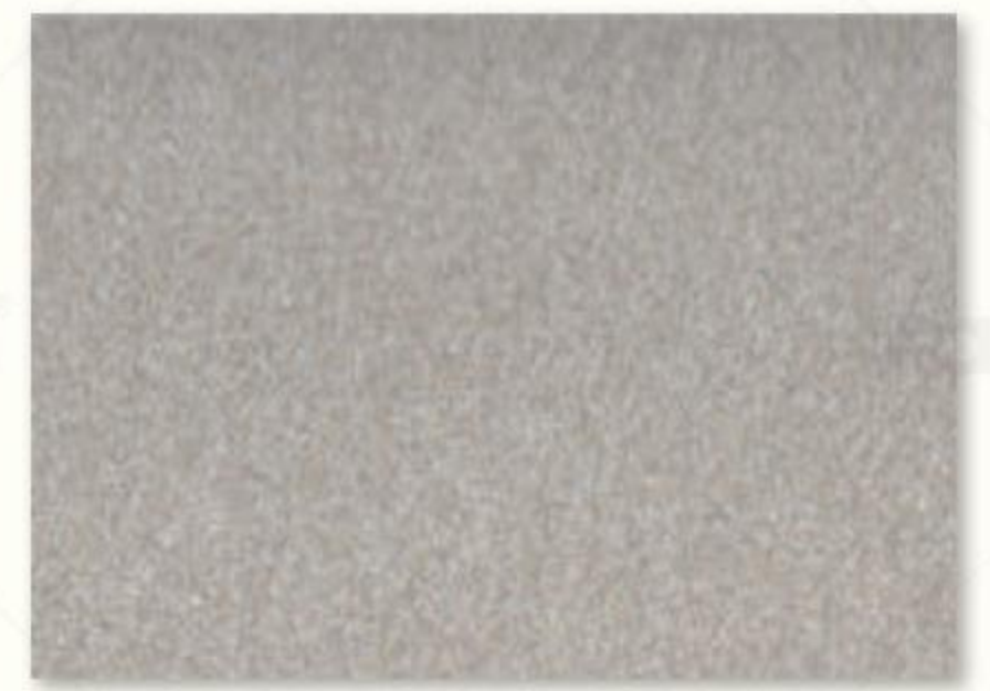
S底 + M69 (100g x 2)