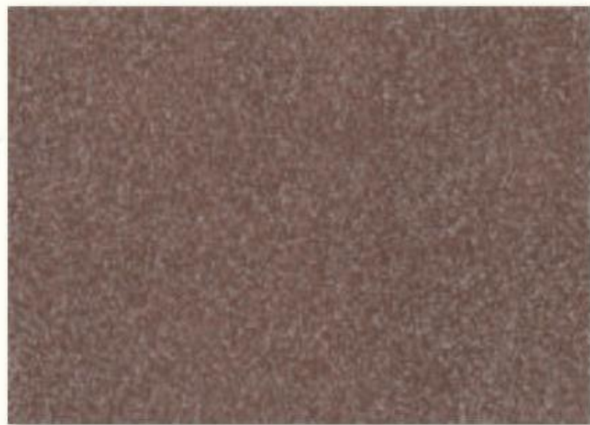
S底 + M50 (100g x 2)