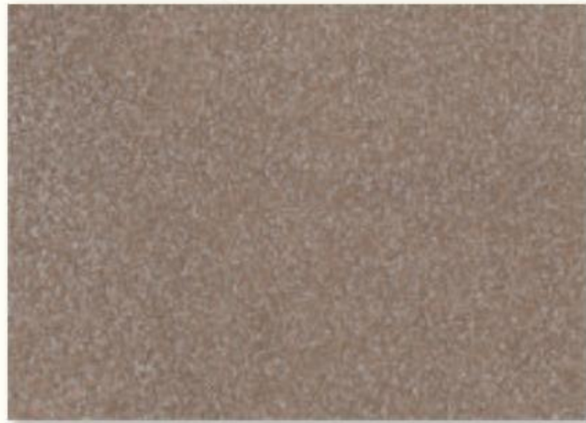
S底 + M73 (100g x 2)