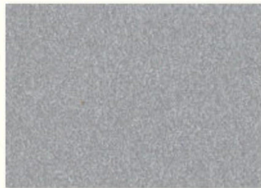
S底 + M80 (100g x 2)