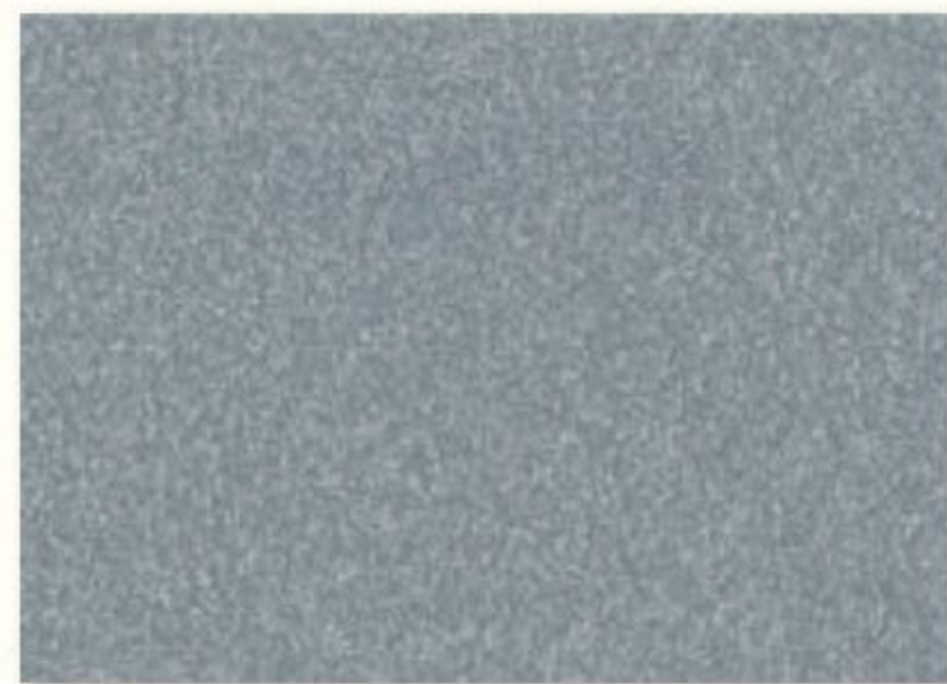
S底 + M55 (100g x 2)