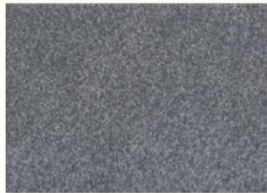
S底 + M84 (100g x 2)