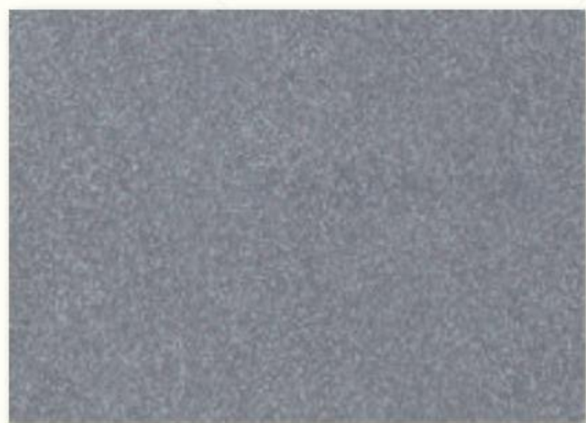
S底 + M23 (100g x 2)