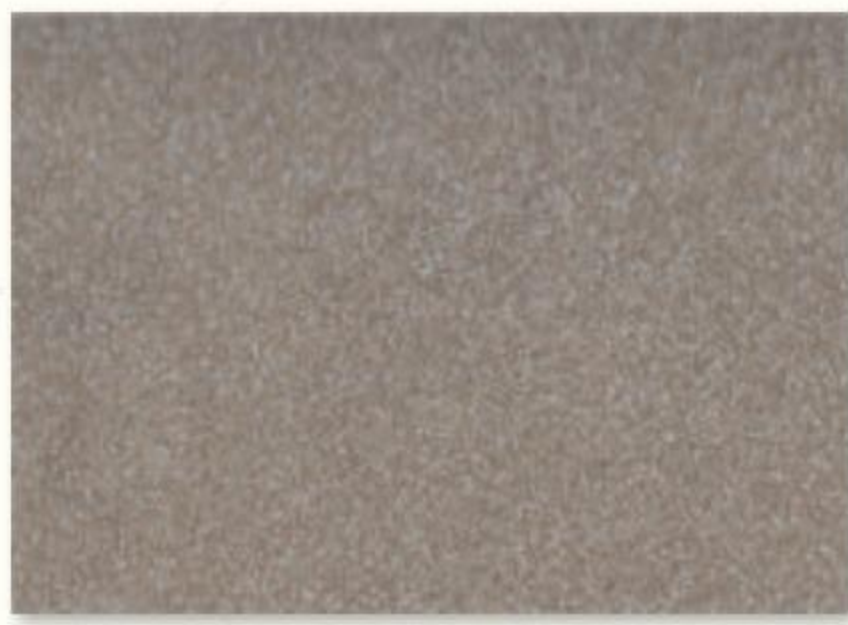
S底 + M69 (100g x 2)