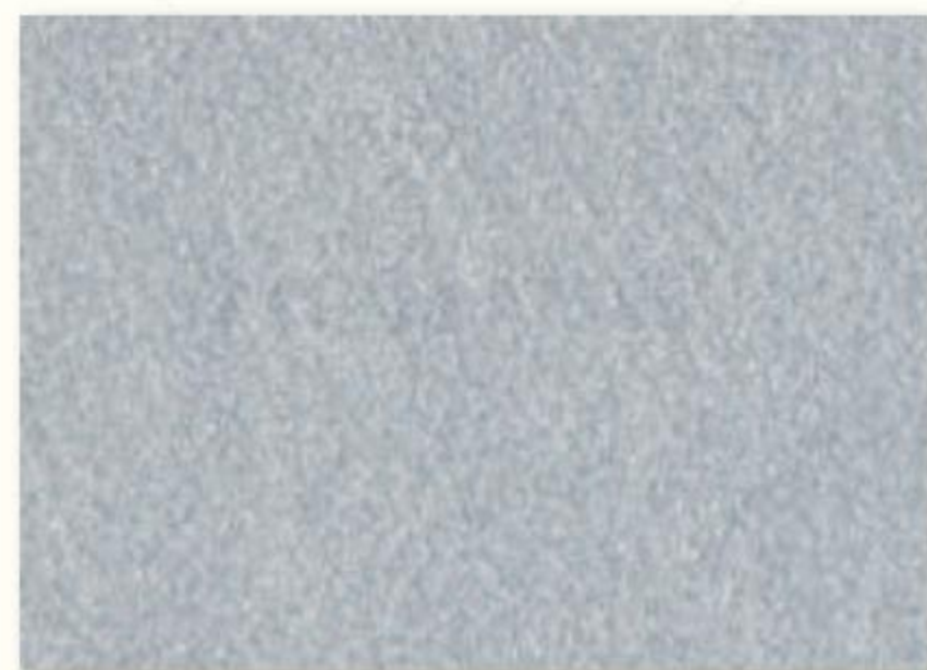
S底 + M23 (100g x 2)