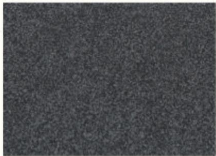
S底 + M84 (100g x 2)