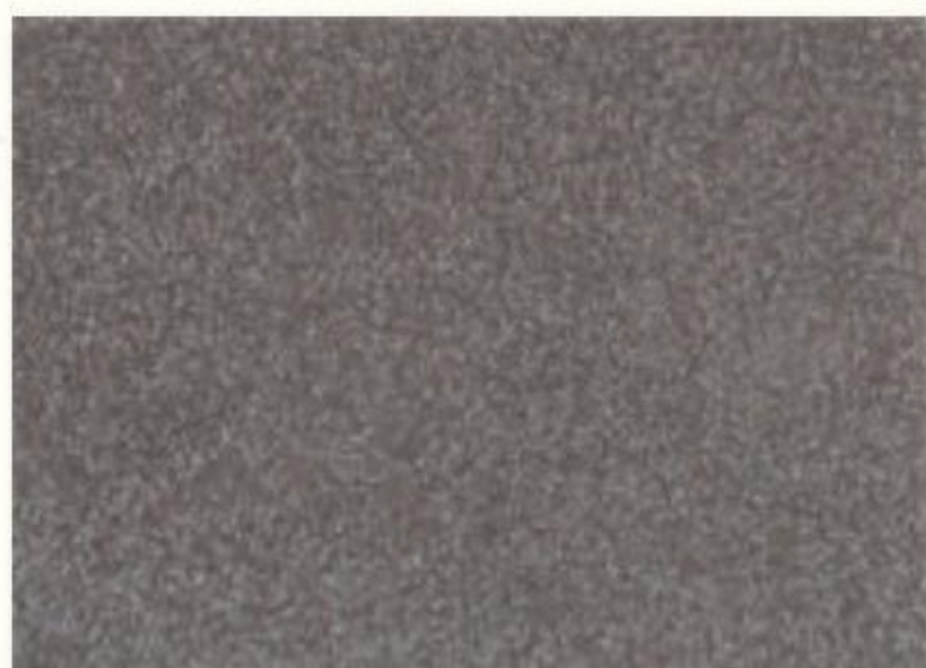
S底 + M41 (100g x 2)