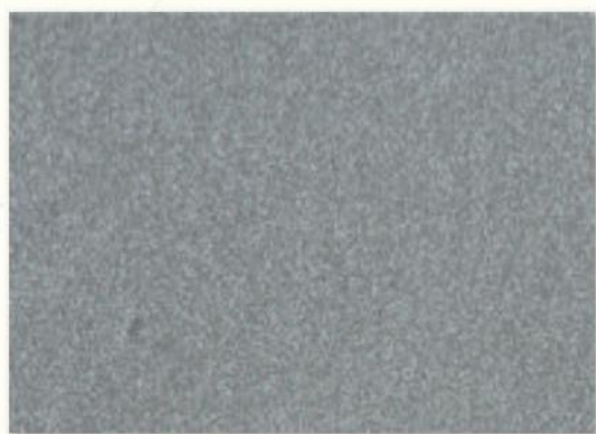
S底 + M75 (100g x 2)